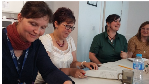
Attendees at the CoH Sync Project Community Engagement event in Dumfries, Scotland.