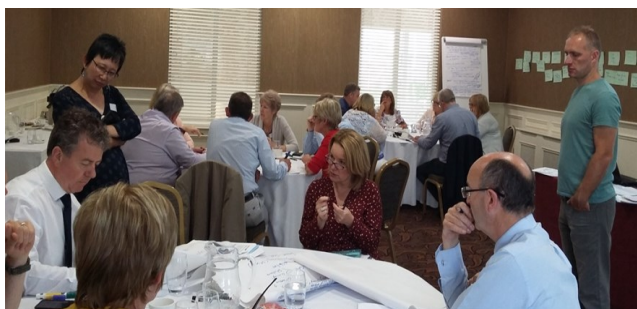
Attendees at the i-Recover workshop in Cavan.

3. East: East Belfast | Armagh | Newry | Louth