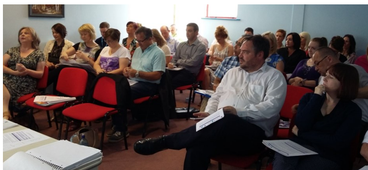
Participants in the CoH Sync Project Community Engagement event in Strabane, Co. Tyrone.

A series of information events was held in late June 2017 across the Hub locations / catchment areas in order to inform and receive feedback from representatives of local groups and organisations on the plans to establish these Health and Well-being Hubs in local communities. Attended by a total of 209 people at 10 events, the CoH Sync Project Planning group will ensure that the views and perspectives of those who attended the events are fed into the procurement planning process. Work is at an advanced stage for the tendering process for the establishment of the Hubs.