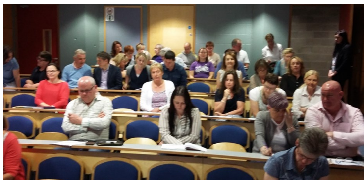
Attendees at the CoH Sync Project Community Engagement event in Letterkenny, Co Donegal.