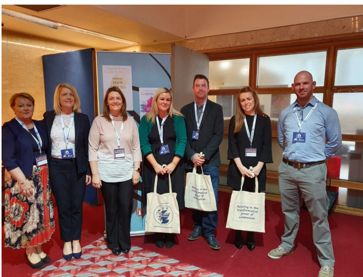
MACE Project Team and Project Board representative pictured at the 'Aces to Assets' conference in Glasgow earlier this year.

Under the direction of the Project Co-ordinators, the Cross Border Community Networks have been meeting, hosting workshops and events, building relationships and planning activities to build sustainable trauma informed communities. They have also been considering interventions and approaches which could improve outcomes for children and young people at risk of multiple adversities. In addition, each of the 5 Project Co-ordinators have been busy working with their Network to complete a scoping report and to develop and agree a menu of interventions that may be suitable for procurement. All of the efforts of the Cross Border Community Networks will help to inform a competitive tendering process to commission a wide range of services for children and young people aged 0-3 and 11-13 years who have been identified as at risk of not meeting their full potential. Once commissioned, these services will be available to families throughout the Cross Border Network areas.