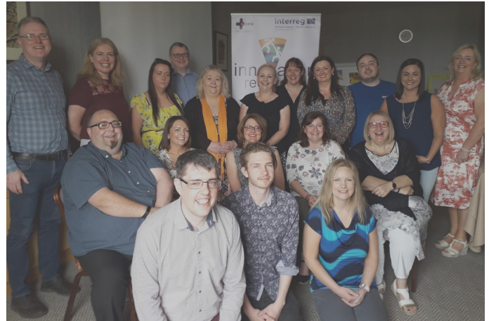
Innovation Recovery Project staff from both Northern Ireland and the Republic of Ireland pictured at the Project Assembly in Sligo in July.

The majority of project staff are now in post which has allowed the project to be delivered across a larger geographical spread. A key focus in recent months has been working closely with the community and voluntary sector in order to create awareness of and engagement with the Innovation Recovery Project. 70 individual meetings/presentations have taken place across all Hub areas and staff have been busy promoting the Innovation Recovery project across 12 counties. This has generated considerable demand for the project's services. In general there is strong interest by service users, carers and the general public in the project's outputs. Additionally, project staff have held 50 meetings within the statutory sector to ensure all health and social care professionals are aware of the project and its activities.