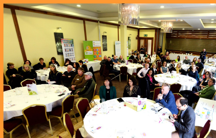
Guests and speakers pictured at the Cavan and Monaghan CoH-Sync Hub launch held in Carrickmacross in June.