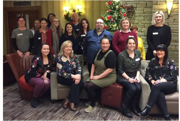
Innovation Recovery Project staff pictured at the 2-day Write to Recovery group training in Donegal in December 2018

The Western Hub is now operational and working closely with the WHSCT Recovery College to scale up Recovery education in the WHSCT area and also in Donegal. The Spring Prospectus was recently launched and includes 35 courses. Engagement with the Community and Voluntary sector in the Derry/Limavady and Donegal areas is ongoing to create awareness and to consult with local communities. The response has been overwhelmingly positive. The Project team are also providing support to Derry Recovery Café.