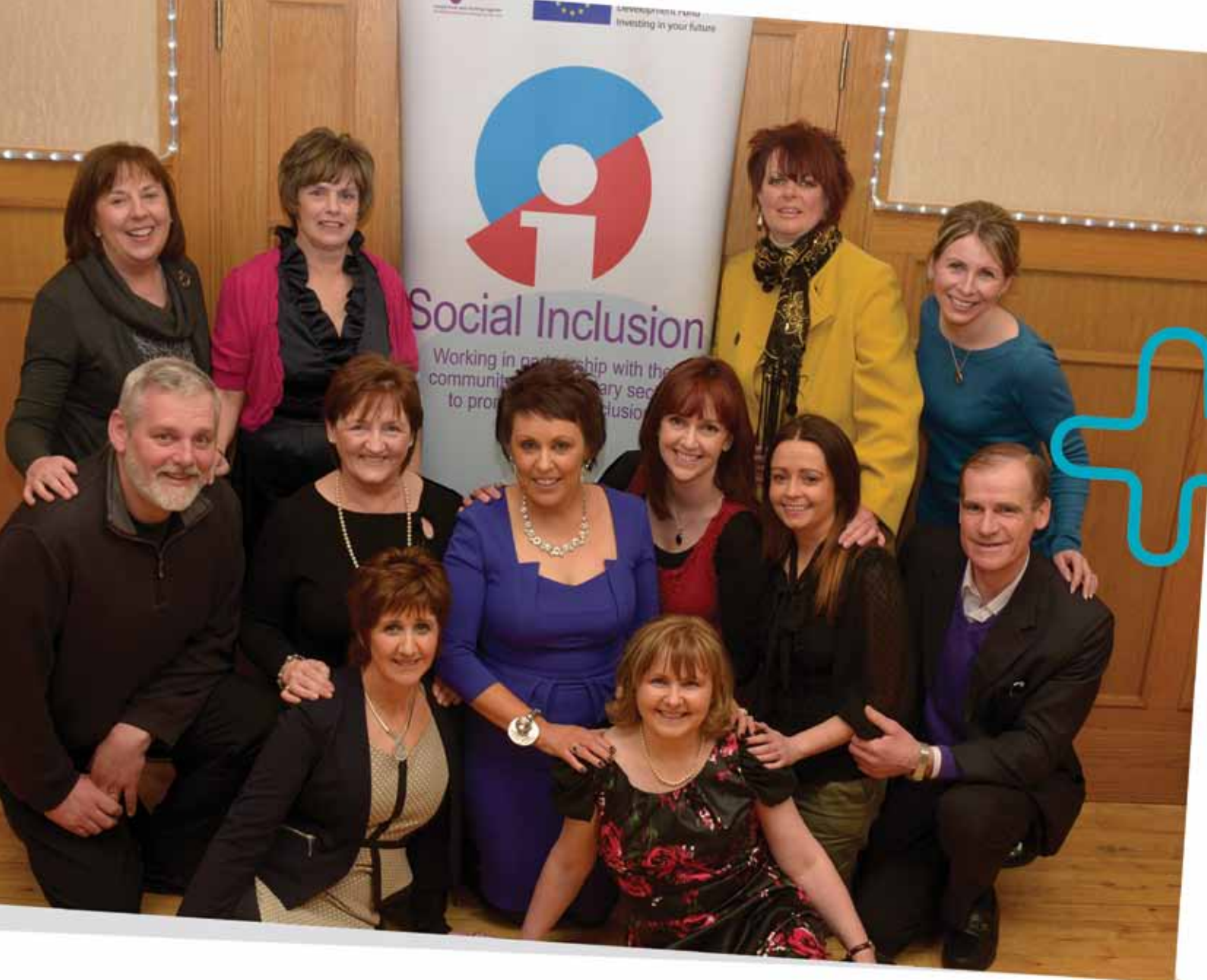
Pictured at the launch of the Cancer Outreach and Support Together (COAST) group for women with a cancer diagnosis in the South Armagh area. The formation of the group was supported by CAWT Social Inclusion Project, with funding from the European Union's INTERREG IVA Programme.