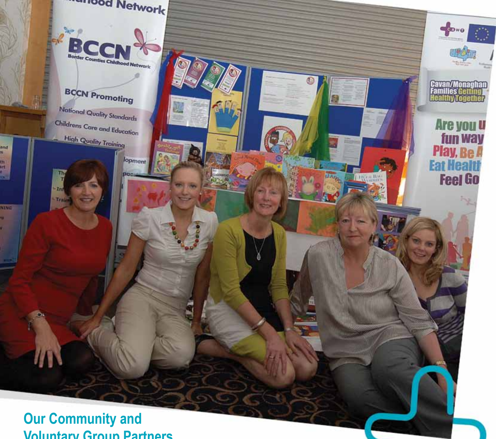
Our Community and Voluntary Group Partners