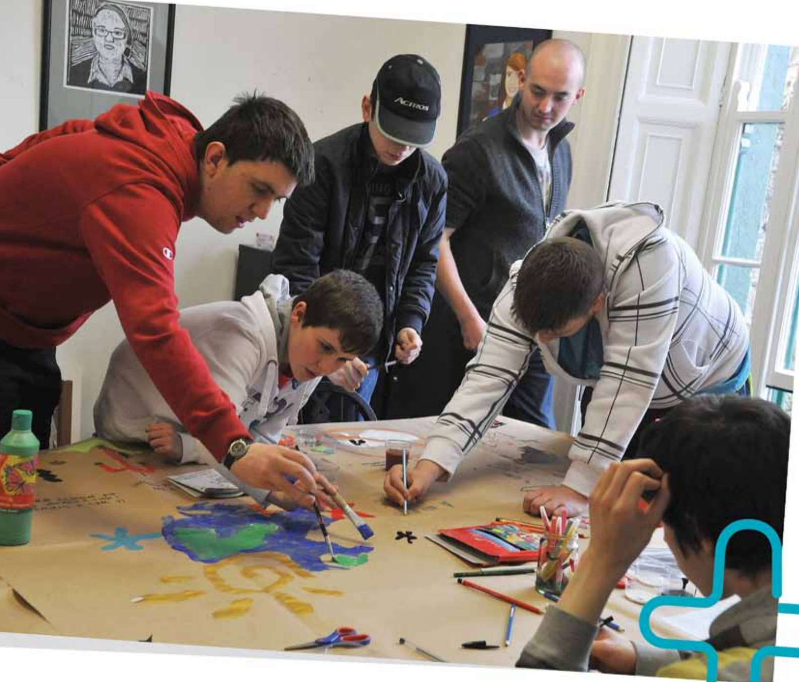
Young people from the Dundalk area at one of the HSE events to celebrate World Autism Day.