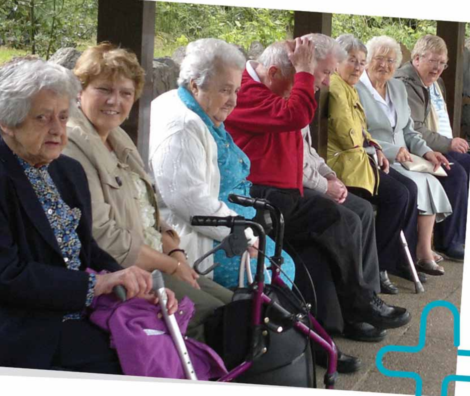
Day trip to Glenveagh National Park, Co. Donegal organised by Inishowen Older People's Network.