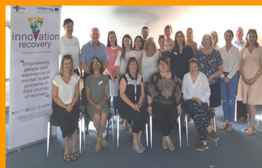
Pictured at the 'Introduction to Co-production' workshop in Ballyshannon.