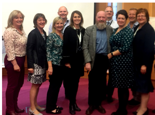
Senior leaders from the HSE and the Western Health and Social Care Trust at the cross border 'Applied Leadership in Adversity' course in the South West Acute Hospital.

Senior leaders from the Western Health and Social Care Trust and the HSE participated in System of Systems (SoS) 'Applied Leadership in Adversity' course in October 2018 at the South West Acute Hospital in Enniskillen. The overall aim of this cross border course was to share learning and to foster and further develop leadership skills and behaviours within the health and social care community. Leadership in complexity and adversity, making lasting change, problem analysis and resolution were among the topics covered by the course. Overall the course offered a positive approach with the aim of assisting senior staff members to apply and further develop their leadership skills in the currently challenging environment of constrained resources and assisting with the breaking down of 'silo' working cultures. The courses also provided opportunities for networking by attendees who are engaged in similar work on both sides of the border.