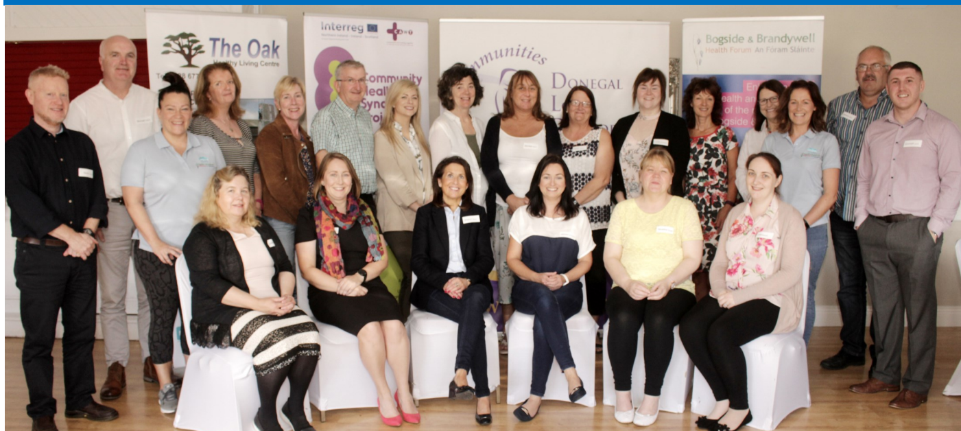
Attendees at the cross border Community Health Facilitators training which took place in Omagh and was delivered by Health and Well-being specialists from NHS Dumfries and Galloway, Scotland.

The Community Health Sync (CoH-Sync) project has established 8 health and well-being hubs: six in total in the border areas of Northern Ireland and the Republic of Ireland and two in south west Scotland. All 8 hubs are now operational and are actively engaging with their local communities to improve peoples' health and well-being in areas such as physical activity, mental health, nutrition, smoking and alcohol consumption. These lifestyle issues are risk factors for the development of long term conditions. The service the hubs offer involves a trained Health Facilitator providing one-to-one support to individuals in the development of a personal health and well-being plan. Support is also provided to individuals to take action to address any issues identified within the risk factor areas.